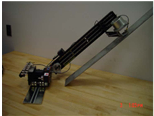
5085 scanner in a +45^\circ and +90^\circ orientation

For applications that require greater end effector stroke, the 5080 can alternatively be equipped with a pneumatic thruster system.