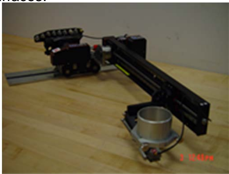
5085 scanner in a standard configuration, shown without cabling attached. Shown with manual skewing collar and spring loaded gimbaling.

The Model 5085 is a remotely controlled automated scanner. It is designed to permit the deployment of a variety of sensing elements including ultrasonic transducers and eddy current probes and is compatible with all AMDATA data acquisition systems. Magnetic wheels are used for mounting to a variety of scanning tracks providing fast installation on a wide range of flat or curved surfaces.